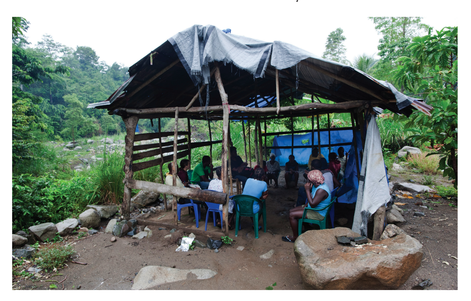
What can other communities learn from Ravine des Roches?

Ravine des Roches is a community in the section communale of Limbe that has actively mobilized local resources to address its problems through local organizations. The achievements include the construction of a school and the provision of schooling for 150 children, and the construction of a road to access the community.