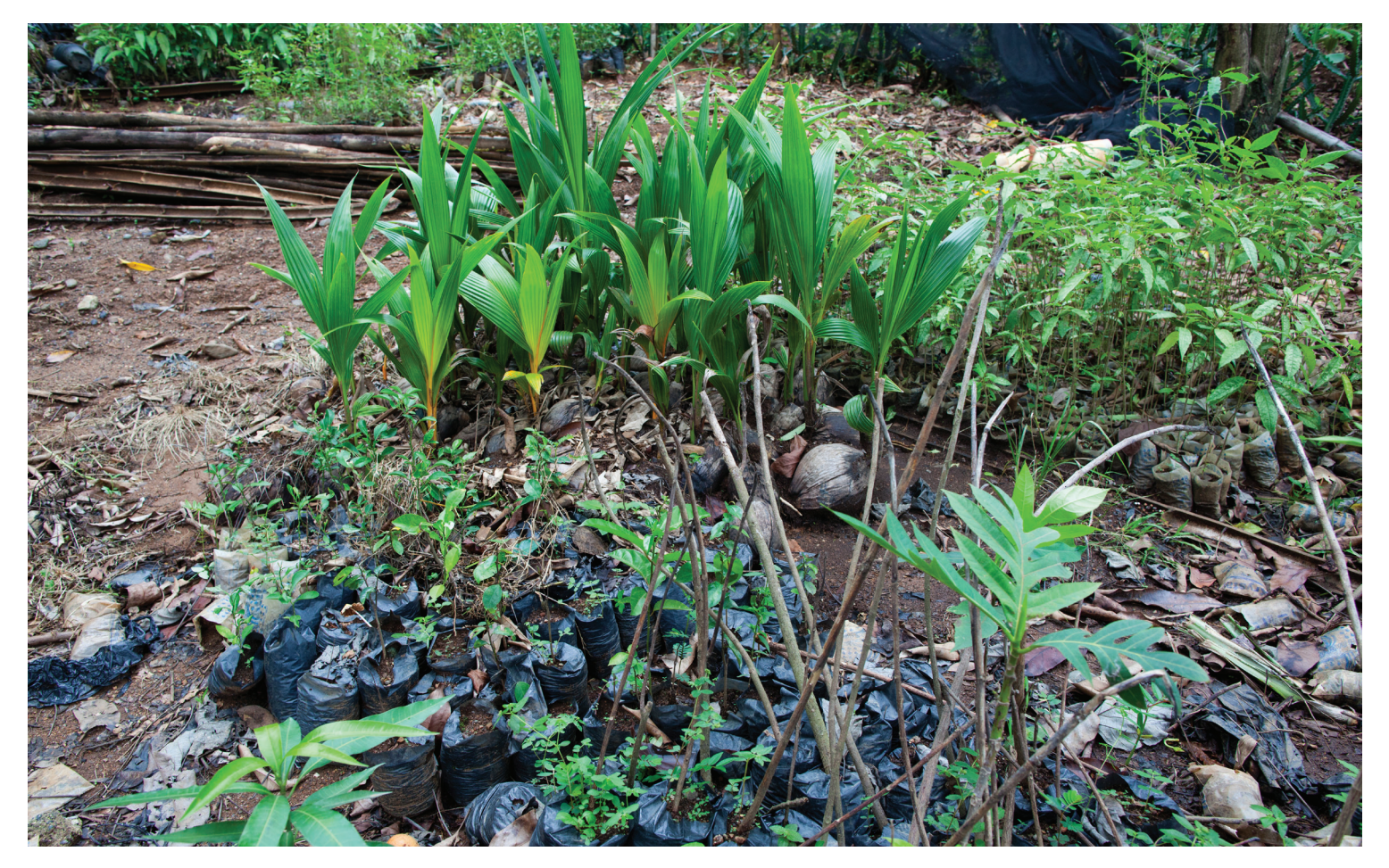
What can other communities learn from ATAL?

The Association of Agricultural Technicians of Limbe (ATAL) is an organization located in Calumette, in the North Department. Its objective is to promote community reforestation and increase the productivity of local farmers. They have also developed a small womens micro-lending program.